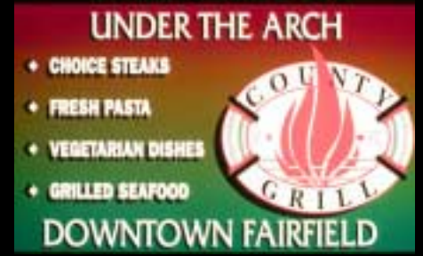
County Grill 3999 1 of 1 - Silver